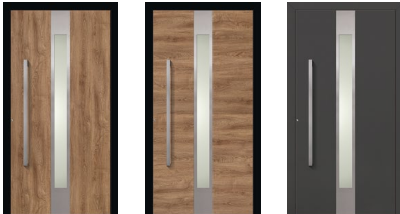
Handle and decorative feature in stainless steel

The original Intelio model is part of the "Inoxa" range of panels, characterized by high-quality stainless steel ornaments. In the PUR design series, the stainless steel is complemented by finely powder-coated black. The decorative frame around the glass insert fully unfolds its effect in combination with wooden looks.