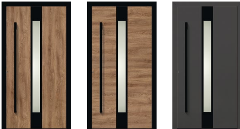
Handle and decorative feature in black (RAL 9005)